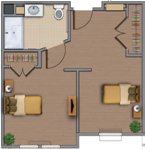
SUITE I 472 Sq. Ft.