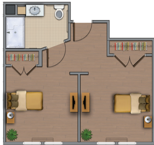
SUITE J 481 Sq. Ft.