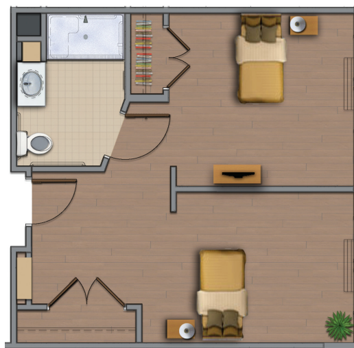
SUITE K 494 Sq. Ft.

Our spacious co-living suites are perfect for social residents who prefer the company of a friend. These suites have all of the comforts and safety features of our private suites plus a floor-to-ceiling privacy wall and personal closets for each resident.